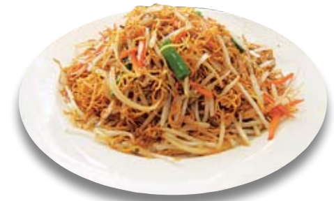
Vegetable Lo Mein