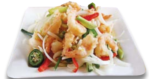
Pepper & Salted Shrimp

Please inform us if you have any food allergies.